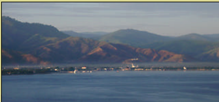
Early morning in Dili, the capital of East Timor, the world's newest country.

That's not completely true (and there are a whole bunch of Catholic churches to prove it), but East Timor, and its capital Dili where I am at the moment, is definitely on the quiet side — except for the presence of several thousand UN staff (blue beret soldiers as well as civilian administrators and aid officers), and at least a couple thousand more aid workers and entrepreneurs from dozens of countries. All in a country of only 850,000! Needless to say, they stand out.