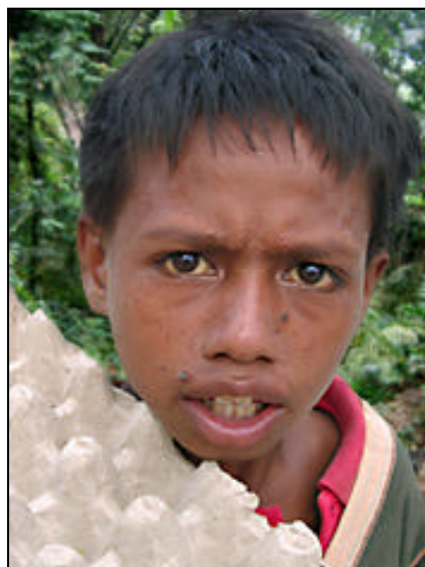
Nearly 70% of the population of East Timor is under 25 years of age. A strong family planning program, in this predominately Catholic country, is of paramount importance. The current population of 850,000 could quickly swell, reeking havoc on the limited social resources.

The Portuguese discovered Timor in 1512. Traders from the Netherlands arrived in 1613. After years of rivalry over control and influence a series of agreements were made which established the boundaries of Timor. The west part became Dutch Timor, while the east part remained Portuguese Timor. Portuguese authority was constantly challenged by local rulers, supported by traders and missionaries who wanted the Europeans to leave. Between 1893 and 1912 there were several bloody clashes. After WWI East Timor was neglected by the.....(see Brief History — next page)