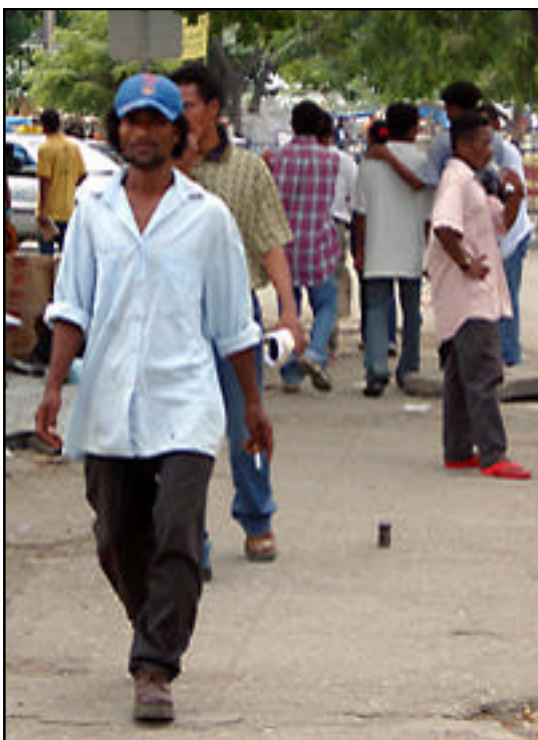
Cruising downtown Dili.

The result led to total anarchy on East Timor, where Indonesia-friendly militias, supported by groups inside the army, killed thousands. Indonesia eventually accepted an intervening UN force, who arrived in September 1999, led by Australia. On 20 May 2002 East Timor's new president Xanana Gusmao was inaugurated. The future is not entirely bright. East Timor is considered to be the poorest country in Asia, and will need generous support in the coming years. (Source: http://www.indonesiaphoto.com/article159.html )