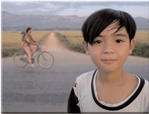
Late afternoon, about 5km outside of Dien Bien Phu city...on the road to Laos.

This was my second visit to Dien Bien Phu, so I felt like a native. At least I knew the lay of the land, not difficult given its size...about 40,000 people in the city, and another