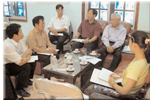
Meeting with Lai Chau Provincial Health Department staff in Dien Bien Phu.

One activity that has gotten under way is "peer education". A total of 25 peer educators have been selected and trained in Lai Chau, 10 of whom are working in the Dien Bien Phu area. In Thailand and